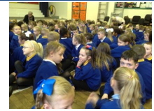
Children discussing what they have learned in Inter-faith Week Assembly.