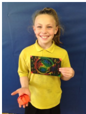
Inter-Faith Week— Sharing learning with another class .