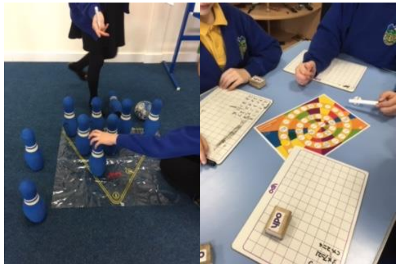
ACTIVE MATHS DAY Monday 4 th March

Please come to Parent Consultations– 18 th & 19 th March. Look out for sign-up sheets soon.