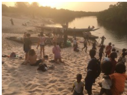
Evenings in The Gambia: families from London and local villages can walk to this small beach from Mbollet-ba to meet and cool off in the evenings after their hard work volunteering.

The annual Our Global School (OGS) visit to our partner school at Mbollet-ba village is now at the planning and booking stage. If you are interested, now is the time to find out more and book it. The trip dates are going to be 15 - 25th February 2019 . The two days away from school are regarded as school visit as there will be two days of lessons in The Gambia. OGS is a parent-led African Education charity and the trip organiser. They have put all the information you need on their home page, including their contact details. Please visit www.ourglobalschool.org