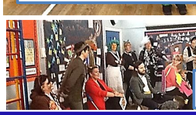
World Book Day character winners