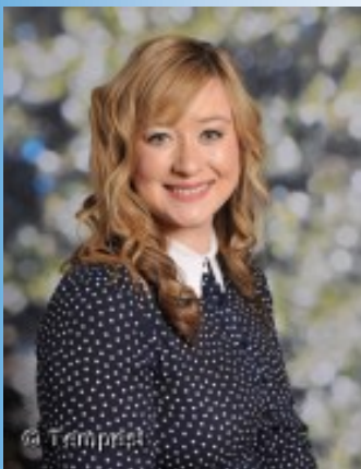
Deputy Designated Person for Child Protection