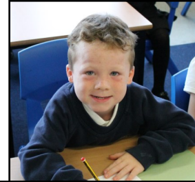
Working hard in Kingfisher class

All photographs can be purchased via ParentPay for £3 per A4 colour copy.