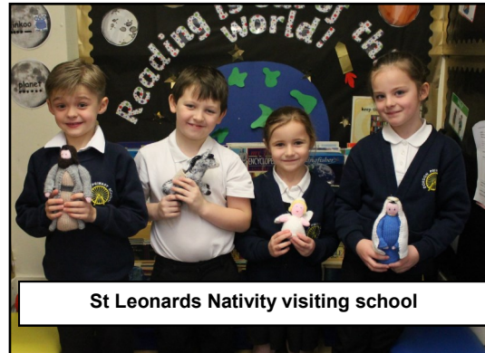
St Leonards Nativity visiting school

If you would like your child to stay after school for the screening of 'Elf' on Monday please make sure you have returned their permission form and paid the £1.50 via ParentPay. If you need a barcoded letter to pay at a Pay Point please contact the school office.