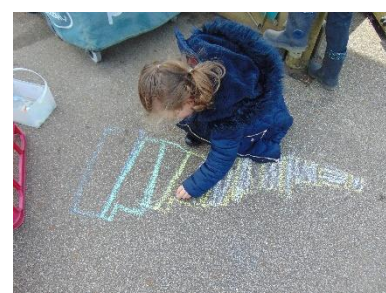
Drawing the number line