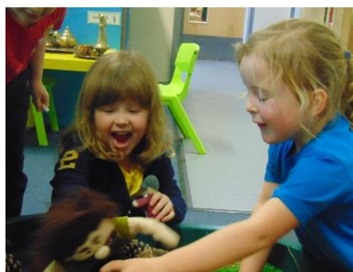
Playing and learning with friends.