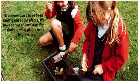
Trencrom class have been finding out about plants. We have set up an investigation to find out what plants need to grow.

Trencrom Class have been finding out about plants. We have set up an investigation to find out what plants need to grow.