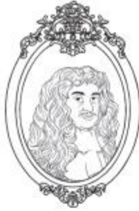
Portrait of Charles II