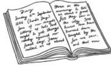
Samuel Pepys's diary, extracts from 2 nd - 6 th September 1666