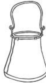
A 17 th century fire bucket