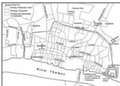
A map of London from 1660