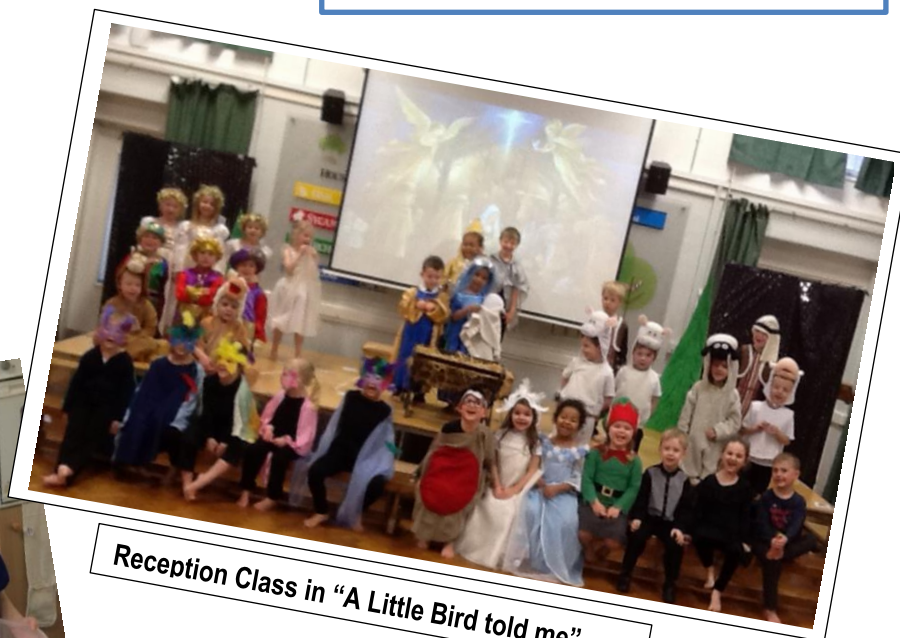
Reception Class in "A Little Bird told me"