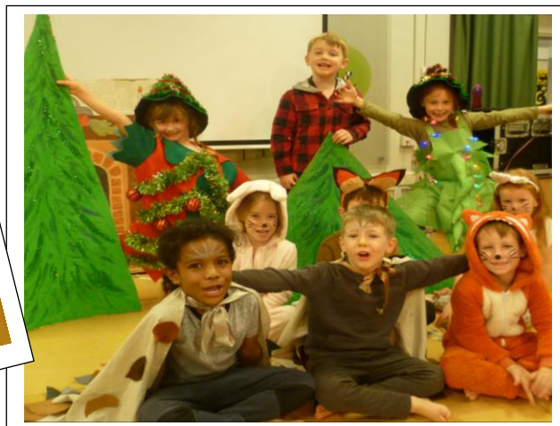
KS1 and their production of "The Smallest Tree"

A huge thank you to the Friends of the Avenue School who raised a fantastic £1,494.49 at the Christmas Fayre and a massive "Thank you" to parents, staff and pupils who supported them.