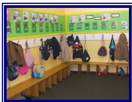
Nursery toilets and cloakroom where the children keep their coats and bags