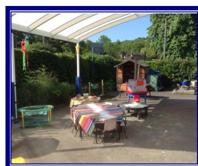
Our outside area and canopy