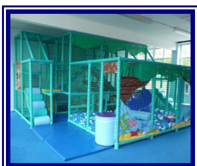
Soft play room