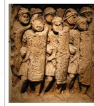
These are people from the Roman times

Boudicca went to battle against the Romans because they had whipped her and her daughters took all of their wealth and left it to her by her husband. This treatment led to her gathering her army together to right the wrongs done to them.