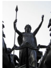
Boudicca queen of Iceni

It wasn't just Boudicca that was battling the Romans it was her and the Iceni tribe fighting the Roman Army too. The fight was amazing but very tough. Boudicca ended up losing.