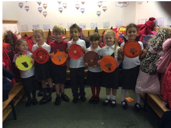
Chestnut Class have been making masks ready for Harvest Service

This week Year 1 have been busy making animal masks for our Harvest Service and have also enjoyed printing with vegetables. In maths the children have been learning about the language of more than and less than and comparing numbers. They have also written their own version of the story "The Sweetest Song." In DT the focus was on tasting fruit ready to make a breakfast for a friend. The children practised their gymnastics and rugby skills in PE lessons.