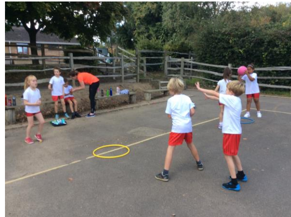
Lime Class learning attacking and defending skills in PE.

This week Year 3 have been looking at what makes a healthy diet and what animals eat in science. The focus in maths has been adding and subtracting 10 and a 100 to and from a number. The children enjoyed practising their attacking and defending skills in PE. The children have been finding out the key features of persuasive writing and have written me a persuasive letter each. I am