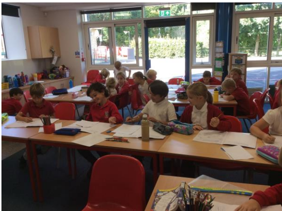
Juniper Class discovering what makes a healthy diet

This week Year 3 have been looking at what makes a healthy diet and what animals eat in science. The focus in maths has been adding and subtracting 10 and a 100 to and from a number. The children enjoyed practising their attacking and defending skills in PE. The children have been finding out the key features of persuasive writing and have written me a persuasive letter each. I am