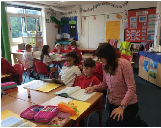
Oak Class using atlases to locate physical features in geography.