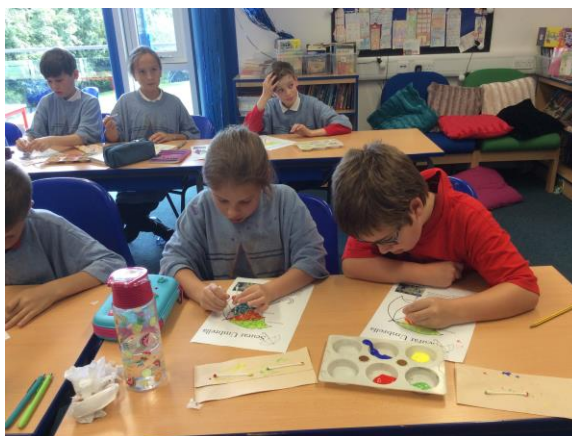
Silver Birch children carefully refining their art work

Year 5 / 6 children wrote a description of a setting in relation to their core text "Rooftoppers." They used editing stations to improve their descriptions focusing on punctuation, grammar, vocabulary, spelling and peer editing. In maths the children