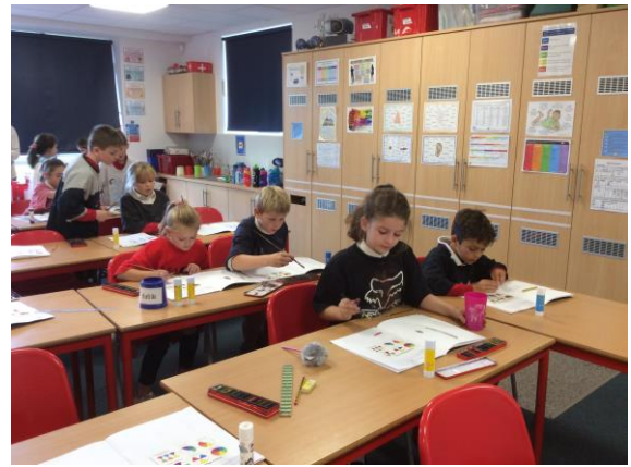
Maple Class colour mixing using paint in their art lessons.