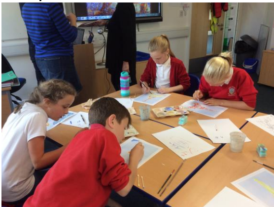
Pine Class practising Pointillism art