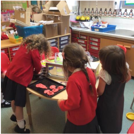
Ash Class enjoyed using play dough to make biscuits and cakes!

This week Reception children have been busy identifying rhyming words and writing their own Monster Poem. They have also enjoyed using the bikes and scooters to support their balance and developing their motor skills. Children have also practised careful 1 – 1 counting and matching the total to the correct numeral. Visits to the mud kitchen have also been a much waited for activity!