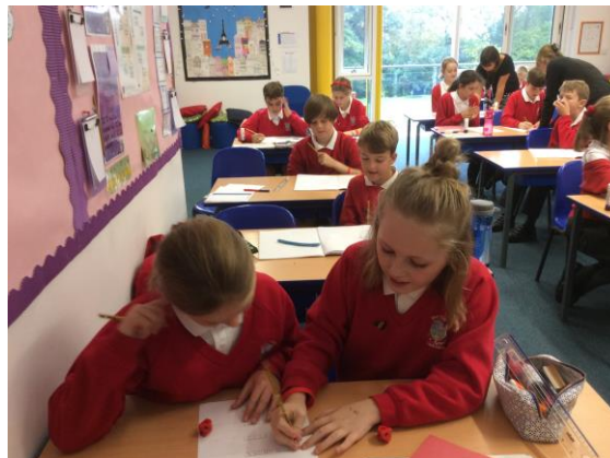
Year 6 children reinforcing their place value knowledge