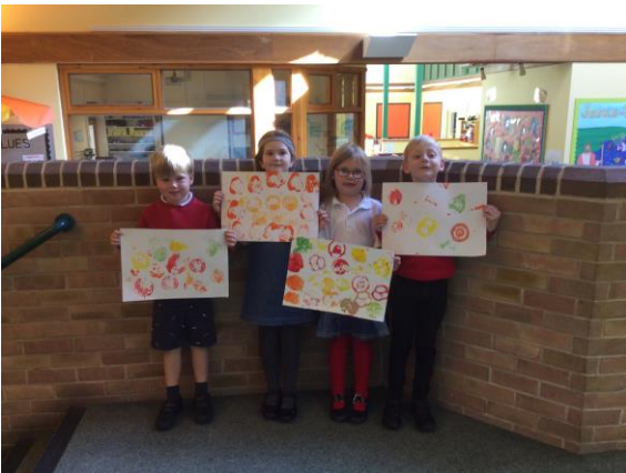
Teddy, Millie, Caris and Dylan are very proud of their vegetable print pictures