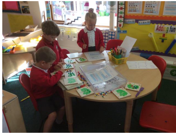
Beech children concentrating hard on their number work.