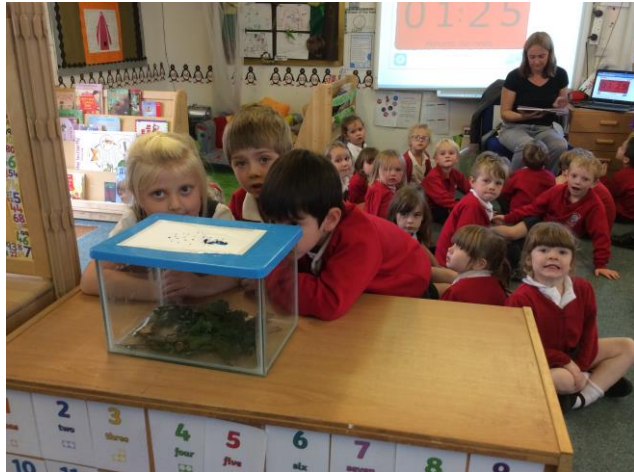
Reception children enjoyed observing a caterpillar