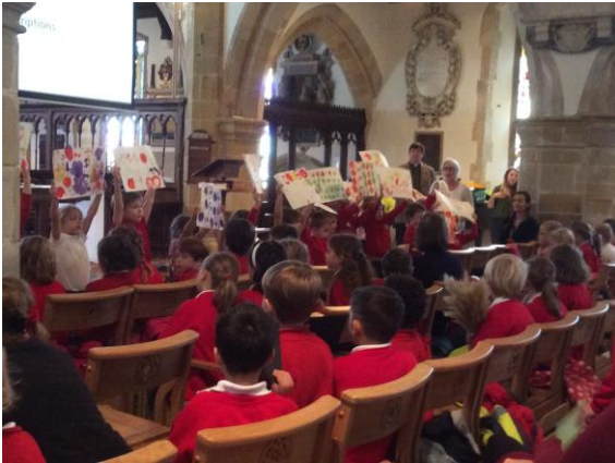
We all enjoyed seeing the vegetable printing Year 1 did