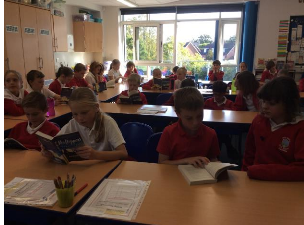
Year 5 /6 are desperate to find out what happens next in "Rooftoppers!"