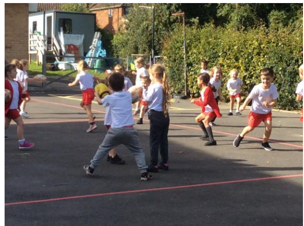
Chestnut Class working on their rugby skills!