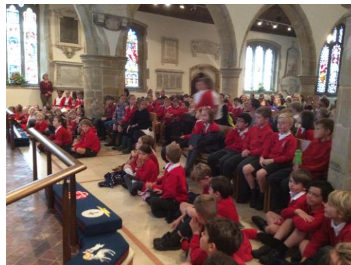
The children enjoyed taking part in the Harvest Service