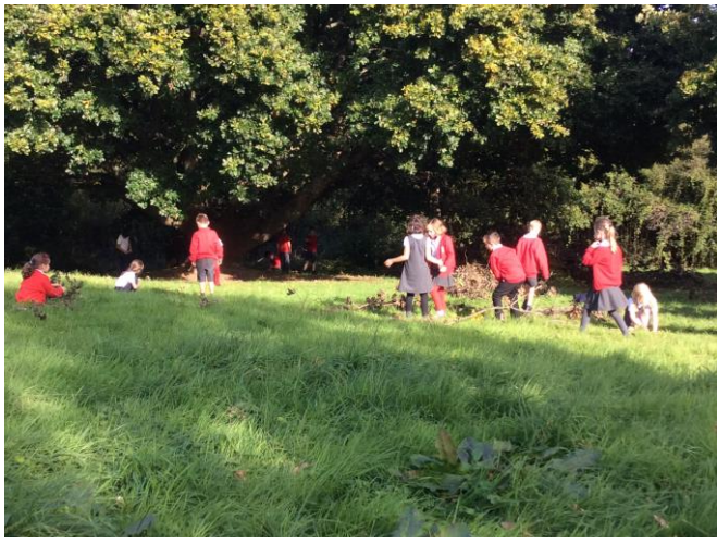
Year 2 children making maps out of natural resources