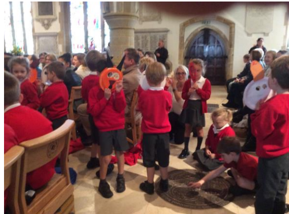
The children's masks for their play and the storytellers told the story of "The Little Red Hen"