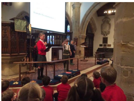
Key Stage 2 Dramatic Presentation