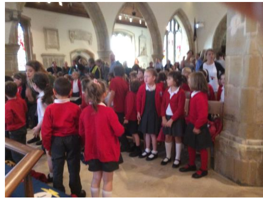
Key stage 1's singing was wonderful!