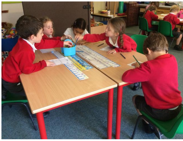
Year 1 children showing a good attitude to learning