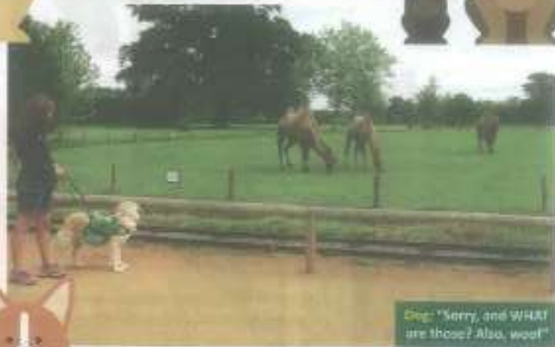
Dog: "Sorry, and WHAT are those? Also, wool!"