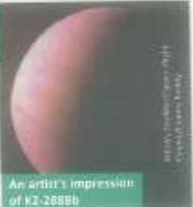
An artist's impression of K2-2888b

The interns handed information over to Exoplanet Explorers, a project that encourages the public to search Kepler's observations. Citizen scientists spotted a third transit, confirming the existence of planet K2-2888b. It is twice the size of Earth, and it may be rocky like our planet or made up of gas, like Saturn. K2-2888b lies 226 light years away in the constellation Taurus.