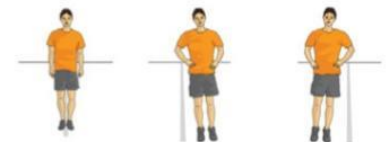
5. SKIER HOPS