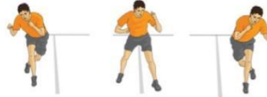
3. SPEED SKATERS