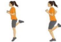
6. BUTT KICKER RUN