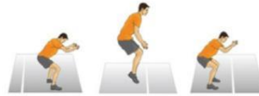
1. FRONT / BACK JUMP SQUATS