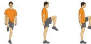
7. HIGH KNEES