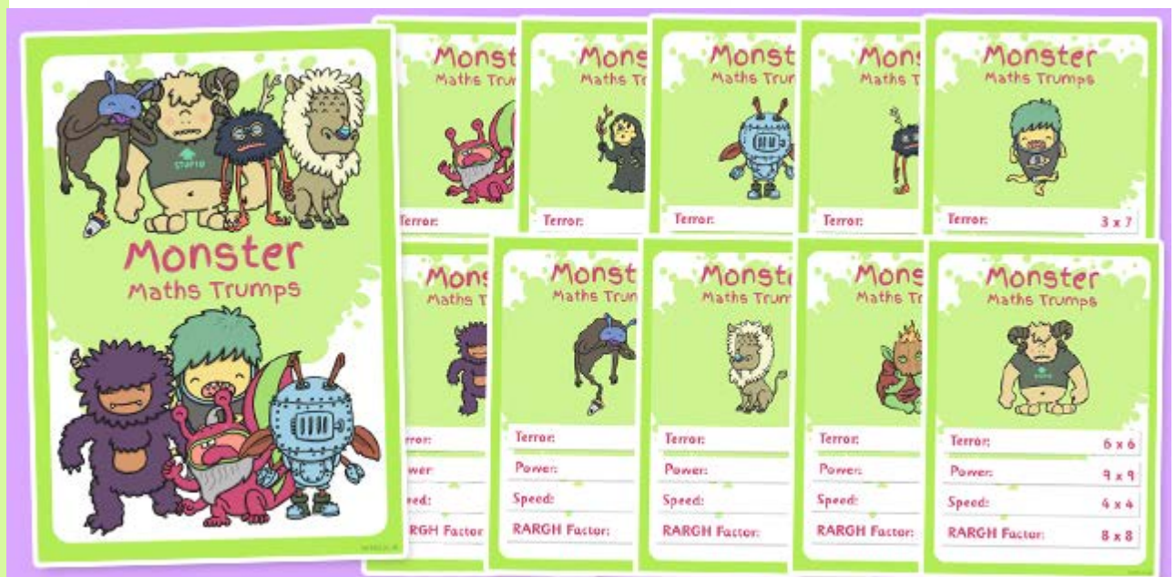
Monster Multiplication Top Trumps