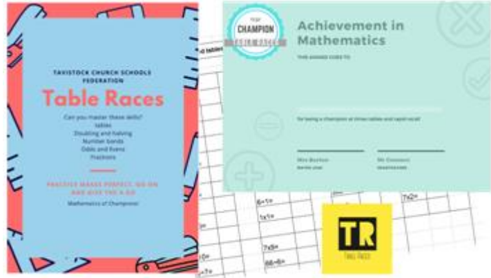
Table Races - You may have noticed over the holiday that the previously advertised Table Races were posted onto the school website. The aim of the table races is to aid children in practising their times tables and other facts and are written to match the 'Just Know It' document that we produced and shared some time ago. The children will complete table races twice a week in their mental maths sessions and, when they meet a specific target, they will receive a certificate in Family Worship. At

the moment Table Races are prepared for Y2 upwards (with one race for Year 1). Over time they will be developed for Y1 and YR too. To access all the resources so that your children can practice at home then head over to our website: http://strumons.tavistockcsf.org.uk/website/rapid_recall/379836