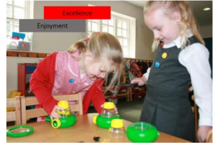
St Rumon's Infant School Open Morning

Tues 23 Jul – 2 pm Y6 Leavers' Service @ St Eustachius