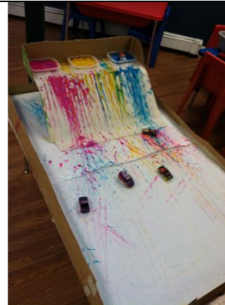
Hedgehogs and Squirrels (Pre-School and Reception) Spring 2021