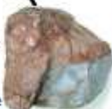
obsidian granite basalt

Far underground, the temperature is so hot, rock melts into a liquid (molten rock). When the liquid is underground it is called ' magma ' and it can cool to form an intrusive rock. When it spills out (volcano), the liquid is called ' lava ' and it cools to form extrusive rock.