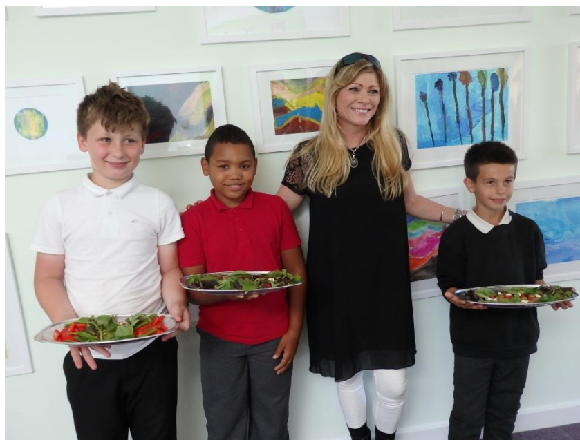
The Official opening of the “Every Child is an Artist Art Gallery”

“He has come on so much both socially and emotionally and academically. It was lovely to see him recite the poem this morning about the PRU - it made me really proud.”