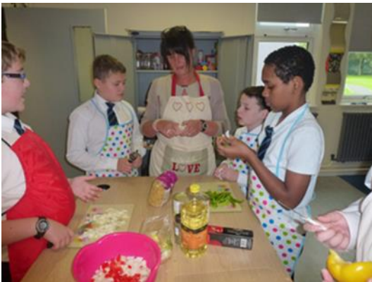
A Cherrywood Centre baking session