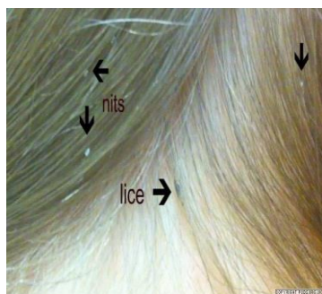
This is what to look for

Always follow up any treatment method as directed by the instructions on the product you're using. Even with treatments that are claimed to kill head lice after one application, the Department of Health suggest checking for lice again after three to five days, and again 10 to 12 days after using the treatment. This is because not all the eggs may be killed by the first application. If you choose the conditioner-and-nit-comb method, repeat this at regular intervals until all the nits and lice have gone. Regularly combing through your child's hair and checking will help prevent a reinfestation.