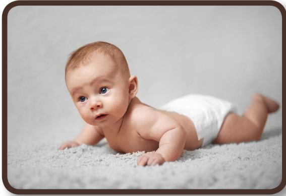
I can lift my head.