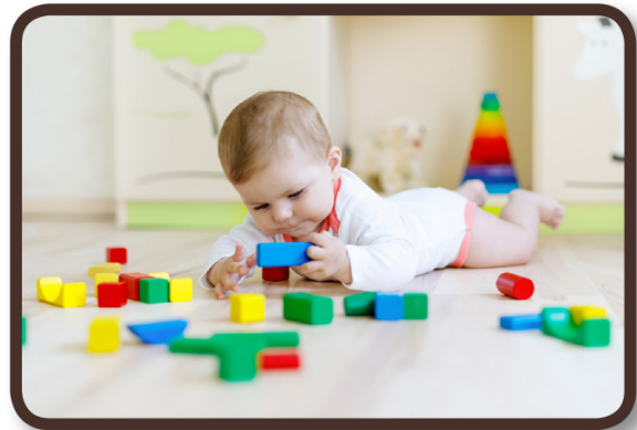
I can grab things.