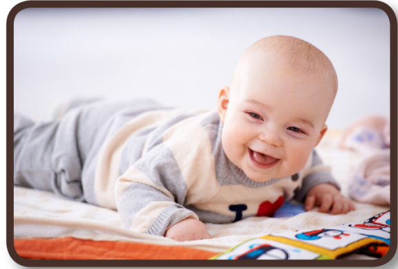
I can make noises.