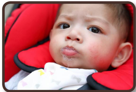
I can blow bubbles.