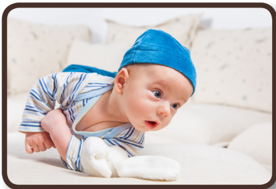
I can roll over.