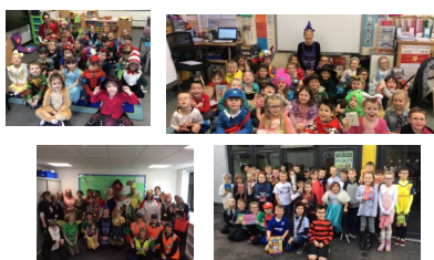
Our three 'best costume' winners!

World Book Day was celebrated at school with both children and staff encouraged to dress up as a character from their favourite book. Everyone made an amazing effort and there were some great costumes to be seen, from the Mad Hatter, Gangsta Granny, Stick Man to Elmer, Harry Potter & superheroes!