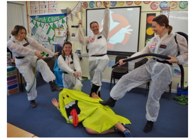
Who you gonna call?