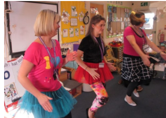
Cutting shapes of a different kind in Reception today!