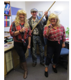
Working 9 to 5!