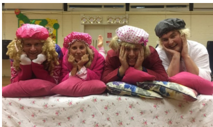
Girls just wanna have fun!