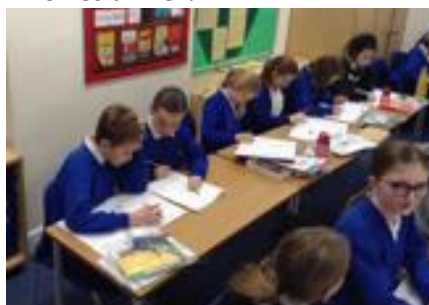
Investigating decimals in pairs

using BODMAS to solve problems. In geography we have been focusing on rivers. We have been learning the key vocabulary to describe parts of the river – like source, meander, tributary and confluence. We have also discussed why rivers are so important to humans and why we often choose to settle on floodplains. Our RE unit on pilgrimages has led us to the story of Saint Bernadette, coincidentally her story also involves a river!