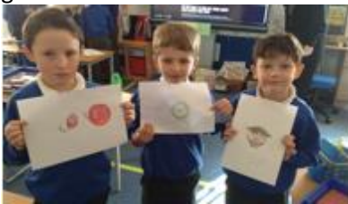
Red nose designs ready for Top Trump cards

The children really enjoyed the activities planned by our school council for Red Nose Day. Thank-you for your kind and generous donations.