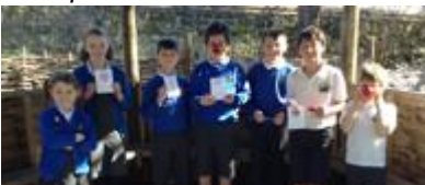
Our school council with some of their Top Trump cards