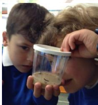
Looking closely at minibeasts!

This week has been all about spiders and we have read The Very Busy Spider by Eric Carle. Year R have completed phase 3 phonics and Year 1 have completed phase 5a phonics. We have read Handa's Surprise and drawn, painted and described the fruits. We have talked about the parts of plants and their function. Year R have been adding groups of numbers together by counting on. Year 1 having adding equal groups together working towards multiplication. We have talked about careful listening and being good listeners. We have been exploring healthy eating choices and exercise.