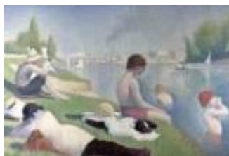
“Bathers at Asnières” 1884