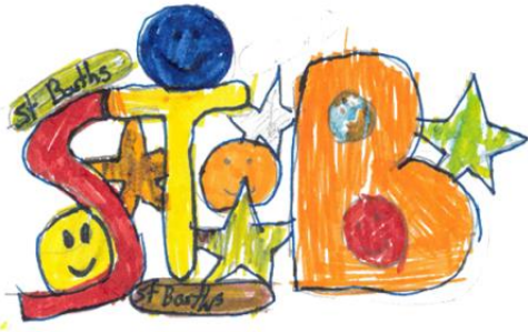
Theoubesta, Year 5