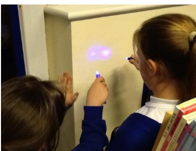
Photo: Looking for secret messages hidden around the library. Could the children find their team’s clue? If so, they would know where to look next.

Escape the room! - Children from years 5 and 6 attended an 'escape room' style event in the library. They needed to investigate an unsolved jewel theft and find four numbers that led to a key to a bank vault. Through a series of tasks and challenges that tested their logic, dexterity and investigative skills, they successfully found the key in a safe in Mrs Slee's room. Thankfully, they also released the pizza that was held to ransom.