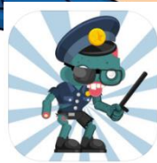
Math Vs Zombies