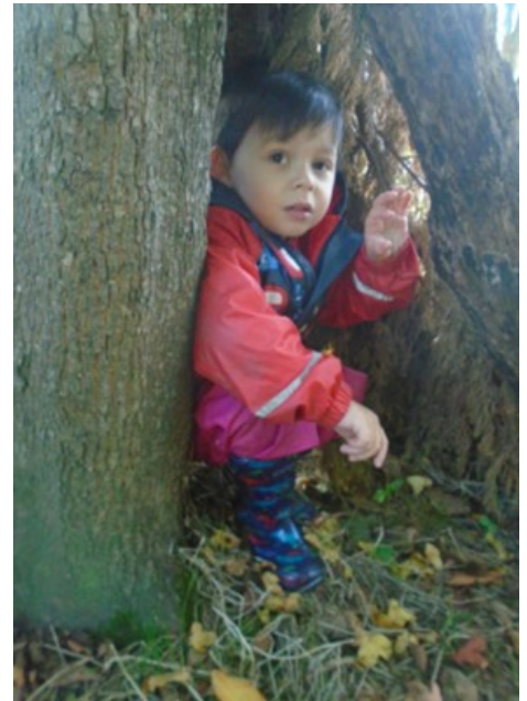
Playing 1,2,3 Where are you? "Can't find me!"