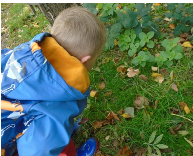
Investigating Fungi found in the undergrowth. Wow. Look what I found!!"