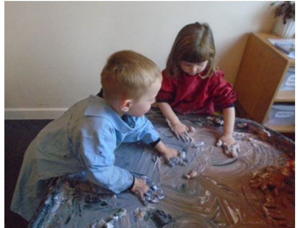
Exploring the texture of the clay when adding water to make our divas