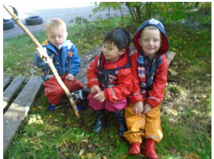
"Who's going to make the BBQ to cook the fish we caught?"