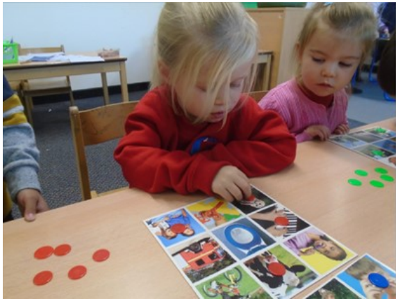
"I got that noise, it's a sneeze"