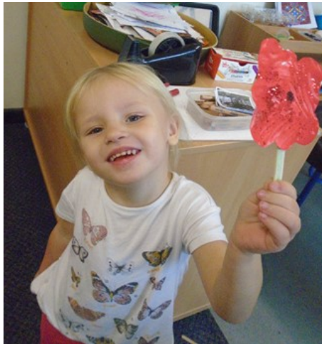
"This is my poppy, it's lovely "