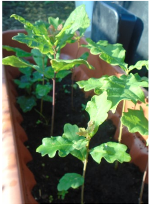
Mighty Oak trees growing from tiny acorns for the Ourboretum project