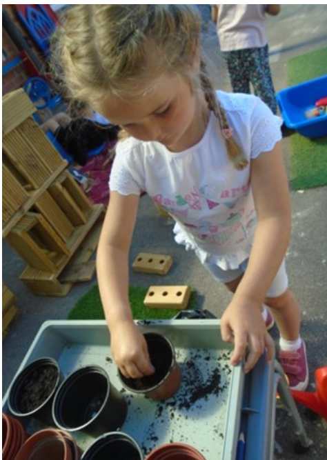
Potting sunflowers and repotting our peppers