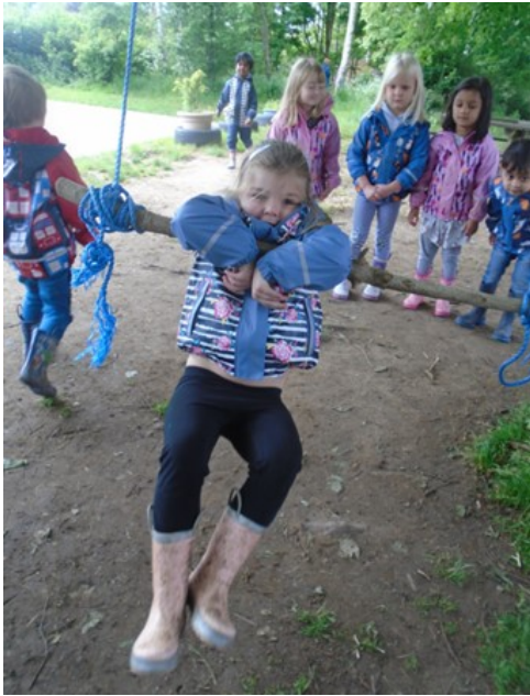
Strengthening our core muscles swinging lifting our legs off the ground