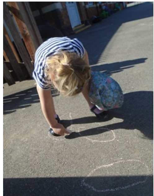
Using our gross motor movements mark making on the playground