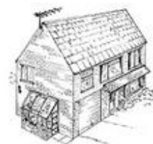
Modern (20th Century)