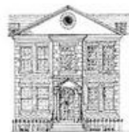
Georgian (18th Century)