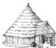
Bronze/Iron Age (2200 BC-AD 43)