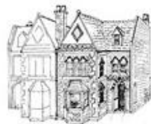
Victorian (19th Century)