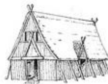
Anglo Saxon-Viking (AD 410-1066)