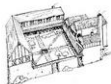
Roman (AD 43-410)