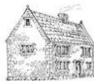
Stuart (17th Century)