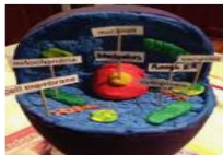
Make a 3D model