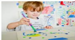
Draw / paint a picture