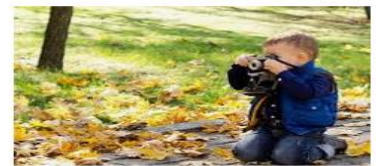
Take a photograph

Competition: Using your creative skills, represent one of these topics to display in school!