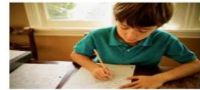
Write a story or poem