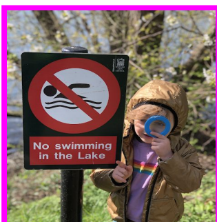
Quin went on a treasure hunt!