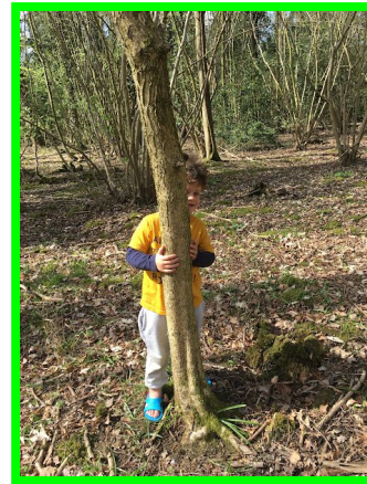
Alfie played hide and seek in the woods!