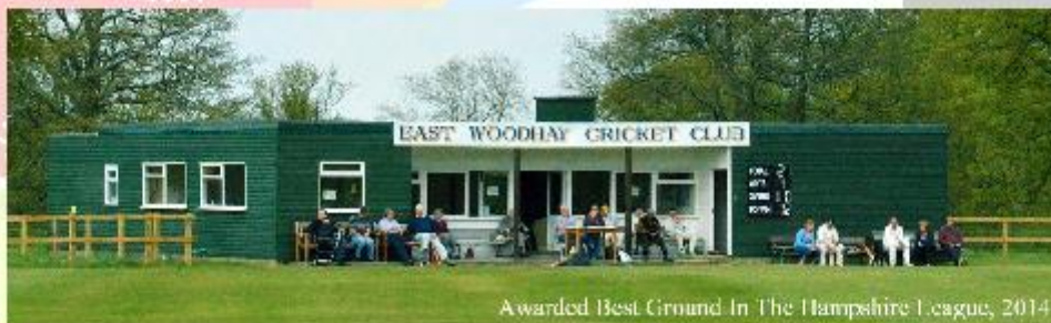
Awarded Best Ground In The Hampshire League, 2014