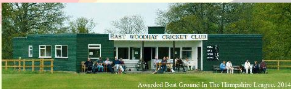
Awarded Best Ground In The Hampshire League, 2014