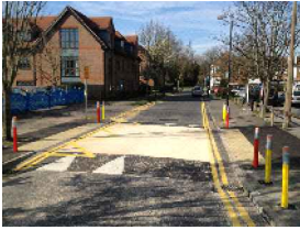
Yellow and red pencil bollards