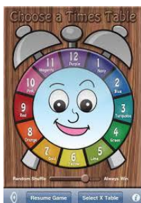
Times Table Clock (Great for pupils with SEN)