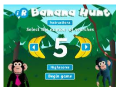
Banana Hunt (Angles)