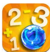
Marble Math Junior (Variety of areas)