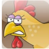
Chicken Coop Fractions (Fractions)