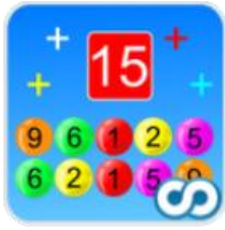
Bubbles of Math (Addition)