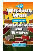
Wipeout Wall (Multiplication and Division)