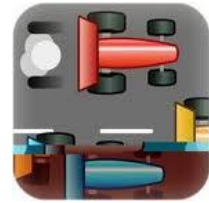
Grand Prix Multiplication (Times Tables)