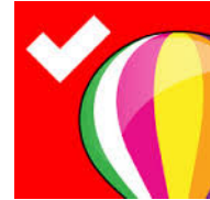
Maths, age 4-6 (Various areas)

These are just some of the great engaging maths apps available. Although they have been checked by the school, in the interests of e-safety please make sure that you have familiarised yourself with the app to ensure you are happy for your child to use it.