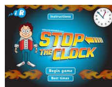
Stop the Clock (Time)