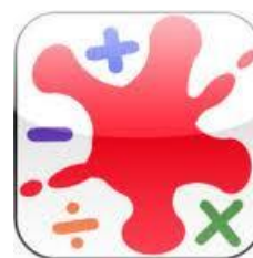
Maths Splat (All four operations)