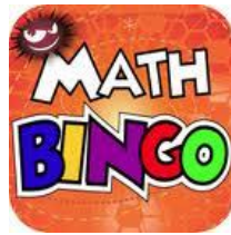
Math Bingo (All four operations)