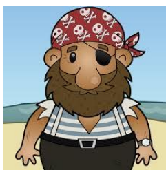
Pirate Treasure Hunt (Problem Solving)