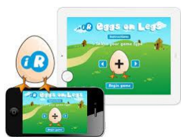
Eggs on Legs (All four operations)