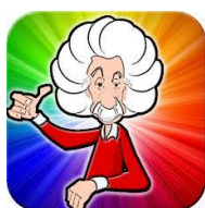
Brain School (Variety of areas)