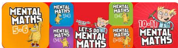
Let's Do Mental Maths – can be bought as a bundle or separately (Mental maths strategies)