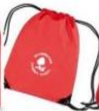
Gym Bag. £4.50e