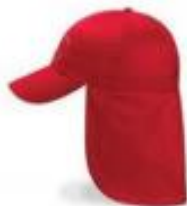
Legionnaire's Cap. £4.50e