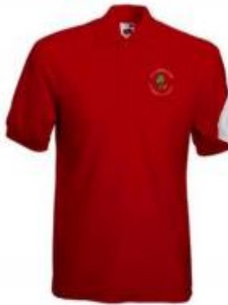
Red Polo Shirt. £7.50e