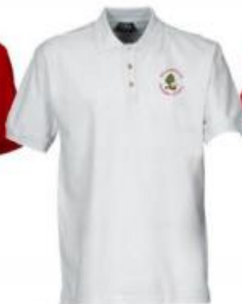
White Polo Shirt. £7.50e