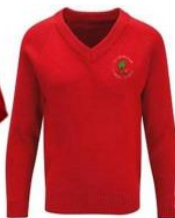
V-Neck Classic Sweatshirt. £10.50e