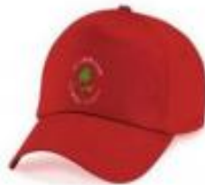
Baseball Cap. £5.00e