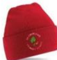
Woolly Hat. £4.50e