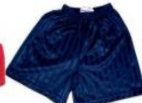
Shadow Shorts. £5.00e