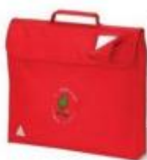
Book Bag. £5.00e