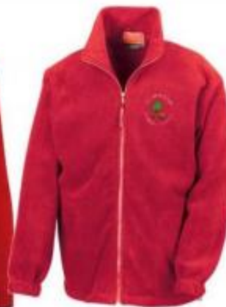
Fleece Jacket. £12.00e