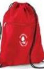
Swimming Bag. £5.50e