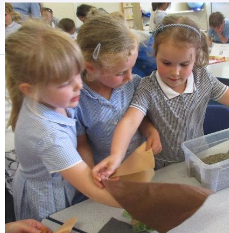
Making lavender bags