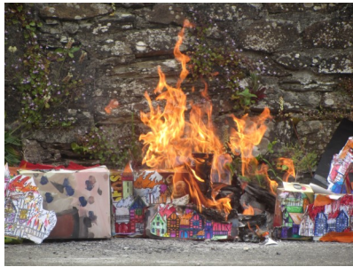
The Great Fire of London

They should know where the people and events they study fit within a chronological framework.