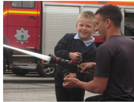
Helping to extinguish the Great Fire of London!

The teaching of History is enriched through immersing pupils in first hand experiences and providing rich opportunities to investigate artefacts.