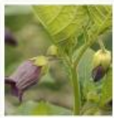
Deadly nightshade can cause sickness or death if eaten.

Some plants can be harmful if they are touched or eaten. They can cause problems with the skin, sickness or even death. It is best to stay away from these types of plants.