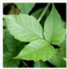
Poison ivy can cause an itchy rash if touched.