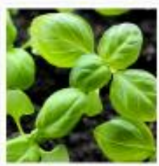
Basil is a herb.

Herbs and spices are plants that can be used in cooking, medicines and perfumes. They can be used straight from the plant or can be dried. Herbs come from the leafy part of the plant and spices come from the roots, seeds, flowers, berries, bark and stems.