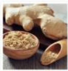
Ginger is a spice.