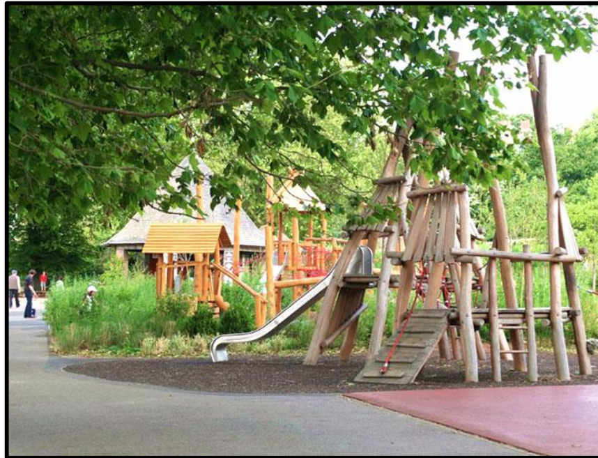
Greenwich Park Playground