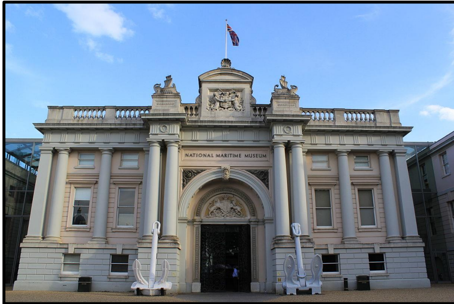
National Maritime Museum