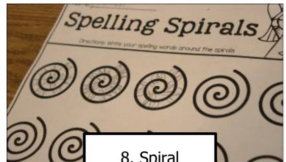
8. Spiral Spelling