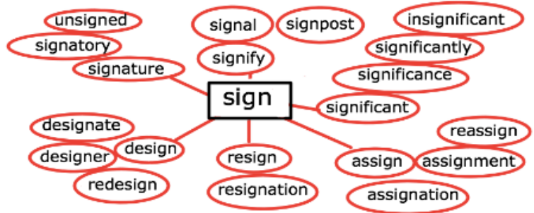
2. Word Detective

prefix root word suffix uncomfortable irregularly disorganised unconfidently disrespectfully