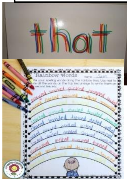
7. Rainbow Writing